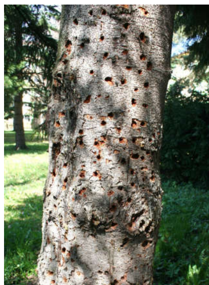
Figure 1. Exit holes of D. micans on a stem of P. orientalis together with holes after woodpecker drilling

Laboratory experiment. To obtain adults of D. micans and to determine the spectrum of natural insect enemies, we took 10 wooden logs from the site of the Forestry school in April 2015. Logs were placed into photoelectors with a total volume of 0.50 m 3 and bark surface of 6.98 m 2 . Logs were taken