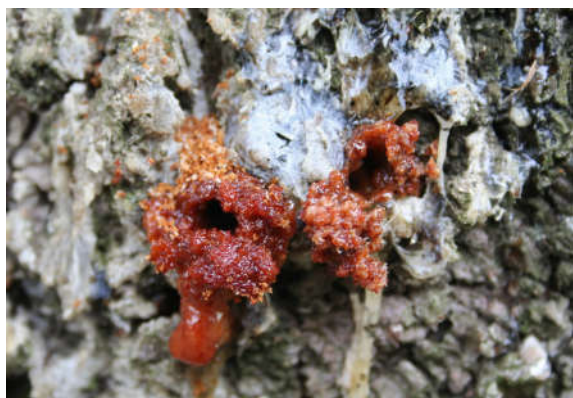
Figure 2. Pitch tubes of D. micans on P. pungens

In February 2015, totally 204 trees of 10 species were observed in order to determine the infestations of